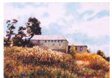
"Morialta Barns" by Dennis Quantrill

Most works have been painted in traditional watercolour style, while others contain segmented elements of design resulting in varying textural effects.