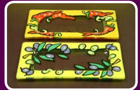
(below) oblong 30 x 22cm platter $47