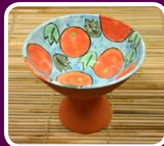
(left) composite bowl (oranges design) by Kerry Keane $25