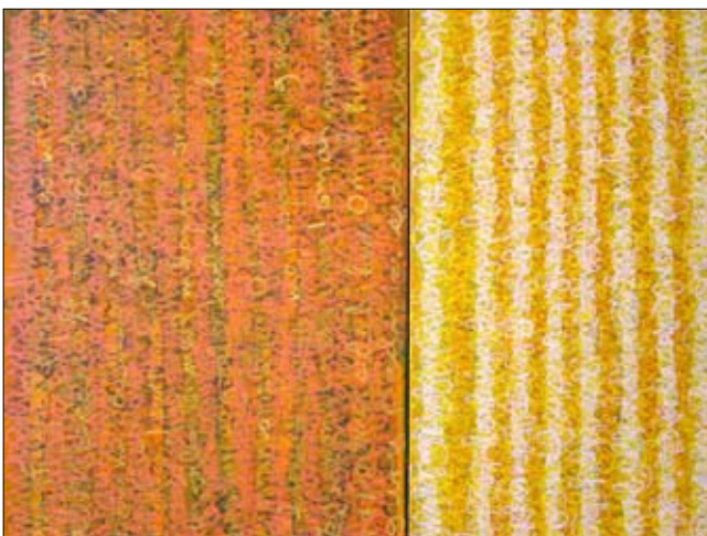
"This Country/That Country". acrylic on canvas by Ian Willding

While the exhibition presents expression of these young people, it also represents an ongoing process that promotes mutual respect and understanding between the wider community and a group of young people.