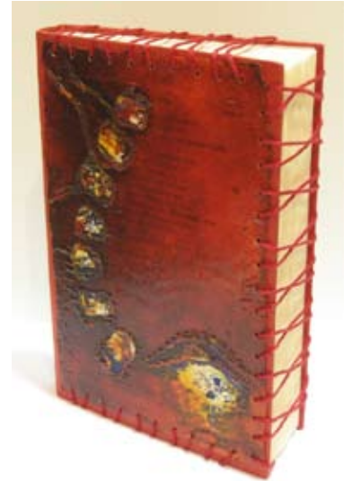
mixed media by Kathryn Hill

painting, printmaking and small sculptural pieces. She often incorporates stitching and thread in the work, combining it with paint and wax.