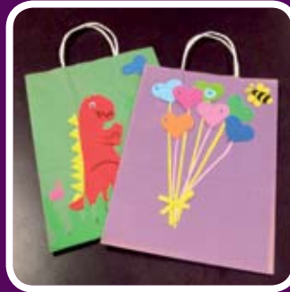
(above) Handmade decorated paper gift bags by Students from Suneden School $4.50 each