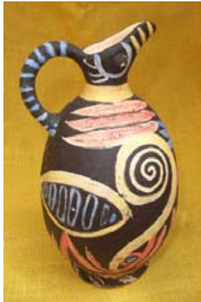
ceramic by Eleni Pitsilioni-Alexiou

All the participants in this show are either direct descendants of Greek migrants of this island or have married into their community.