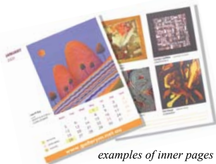
examples of inner pages

Limited edition Gallery M 2009 art calendars are still available.